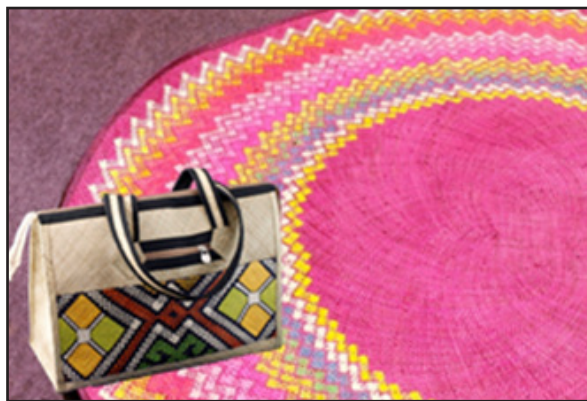
Figure 5: Round mat and handbag are some of the finished products of the technology process

according to the size of the items. Finished products scheduled for deliveries are meticulously packed individually.