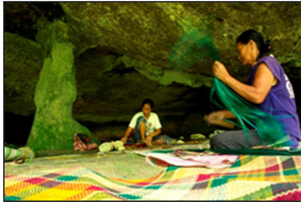
Figure 4: Women of Brgy Basiao, Basey weaving their mats in cave

8. Product packaging, storing and transport - Finished products are individually packed and stored in a cool, dry place. For small items such as a coin purse and souvenir items these are contained in plastic packaging material by 20's to 50's