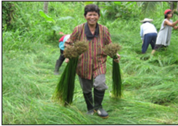
Figure 3 – Harvesting of tikog grass in Brgy Serum

wetlands tikog Fimbristylis globulosa naturally growing everywhere, harvesting is done randomly by the farmers every after three months. The harvested stalks are dried either at the multi-purpose drying pavement of their barangays or at the roadside which is the common sight at tikog producing barangays.